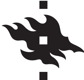
Figure 1.1: The emblem of University of Helsinki. As it is a trademark of the university, its use is governed by some restrictions.